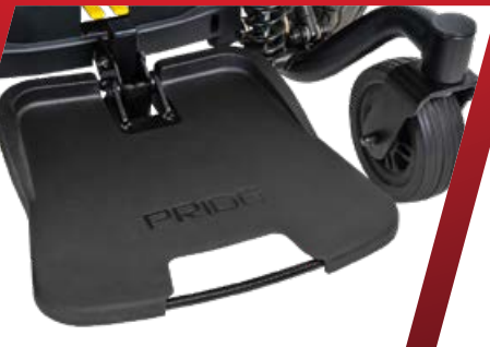
Large footplate with removable rubber cover for easy cleaning