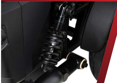
Front and rear independent Active-Trac® ATX Suspension