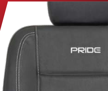
High-back memory foam seat