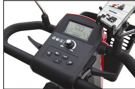
Integrated LCD console display monitors speed, odometer, fault codes & battery life.