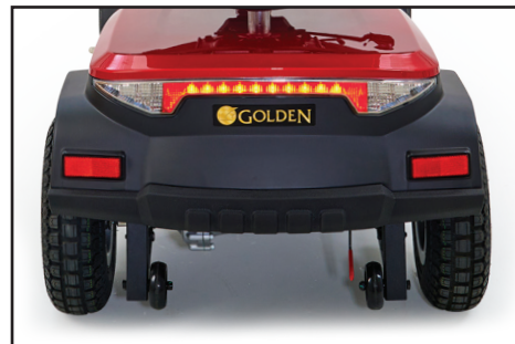
Ultrabright LED rear lights.