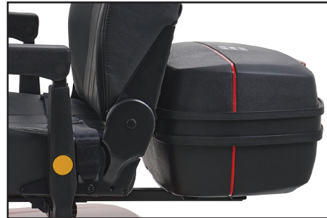
Lockable water-resistant storage compartment comes standard and attaches to the accessory bracket.