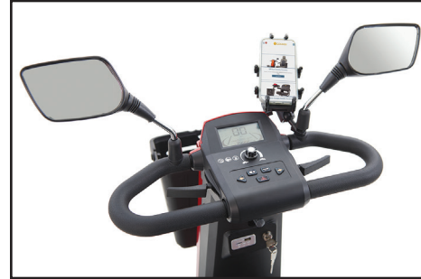
Rear view mirrors, cell phone holder and built-in speaker system with Bluetooth® & USB connectivity.