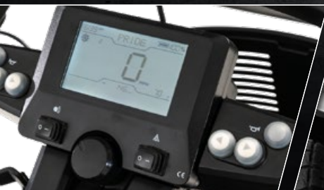
LCD digital display

** Only one rear accessory can be used at a time.