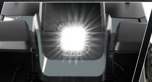
Enhanced LED headlight