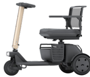
● Silky Bronze