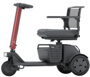
● Garnet Red