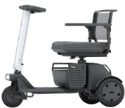
○ Iconic White