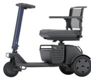
● Lapis Blue