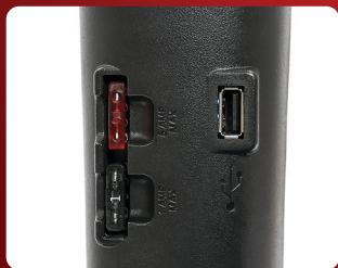
USB charger built into tiller