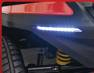
Front LED lights